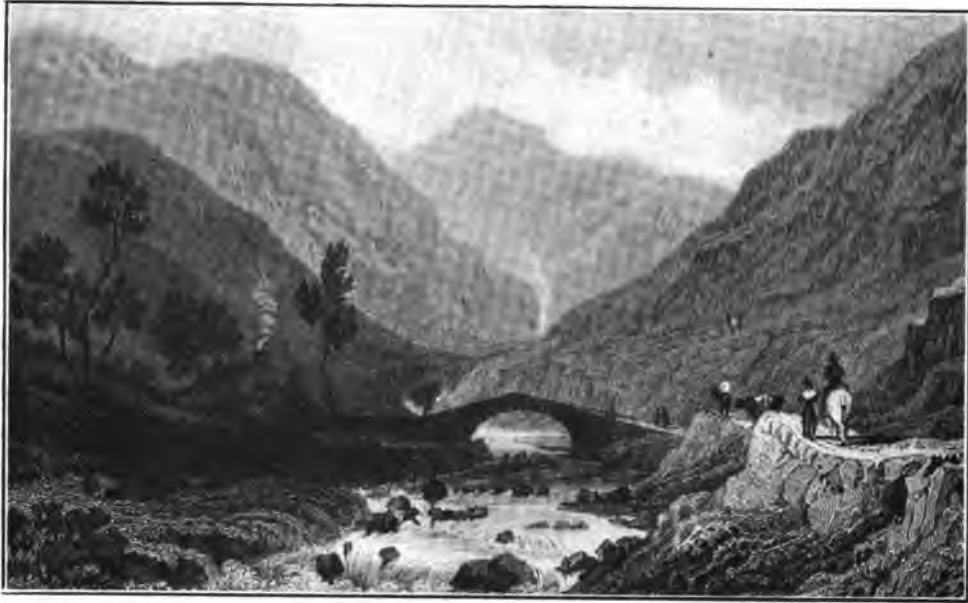
VIEW NEAR ABER